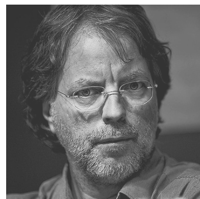
M I A COUTO