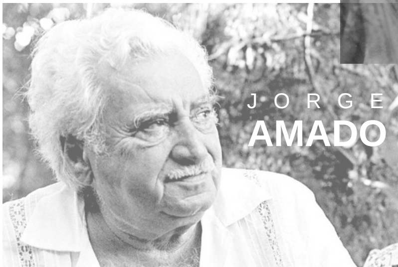
J O R G E AMADO